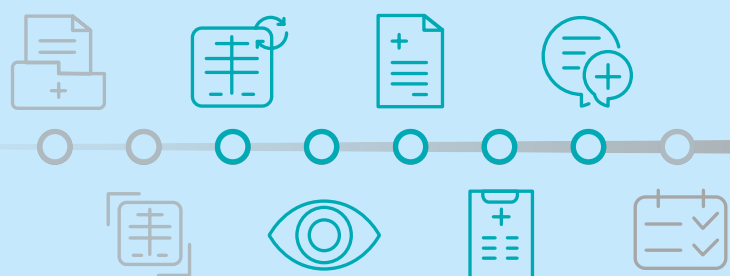
IMAGE PROCESSING, DETECTION, DIAGNOSIS, LABELLING & REPORTING, PATIENT COMMUNICATION

Current applications cover elements from image processing to patient communication, primarily focusing on detection